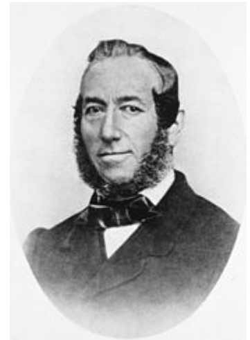
Benedict Stilling 1901