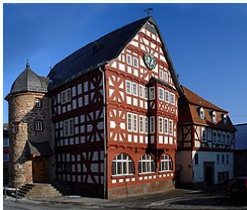
Kirchhain's Town Hall.